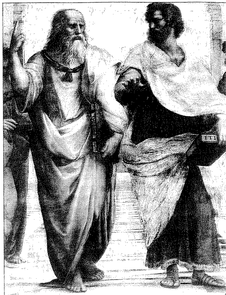
This detail from a famous Renaissance artwork titled The School of Athens shows Plato (left) and Aristotle discussing their differences. (Wikimedia Commons)

Athens had reached its height in political power before Plato was born. Its decline began with a long war with Sparta, a rival city-state. The war ended in 404 B.C. with Athens’ defeat. Athens regained its democracy, but shortly after Plato’s death, the city-state fell under the control of